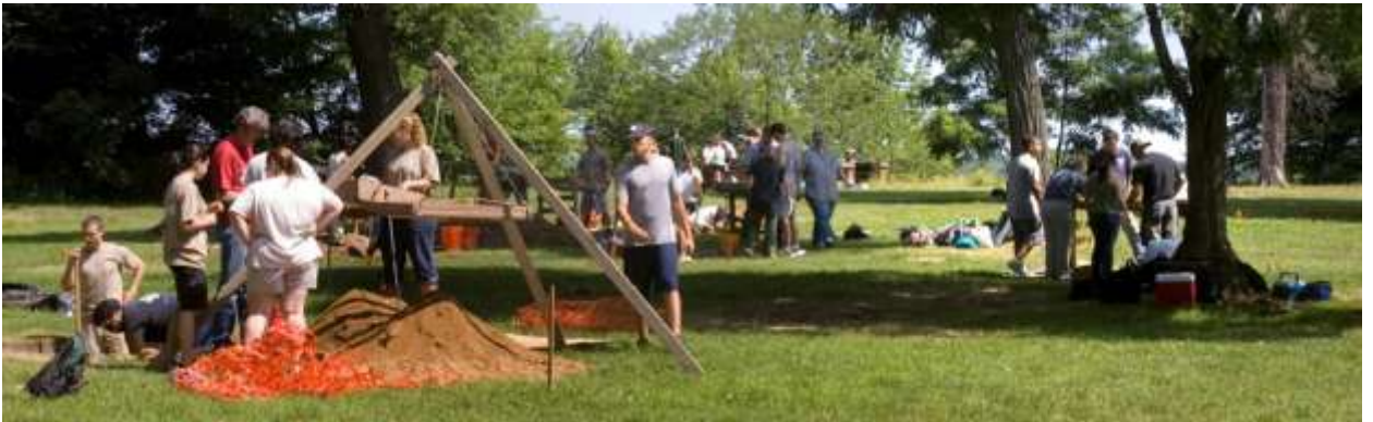
Figure 2: Students excavating at Point Breeze.