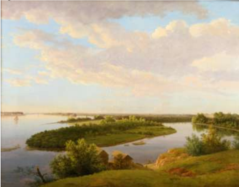
Figure 1: Point Breeze on the Delaware, Thomas Birch, 1818.