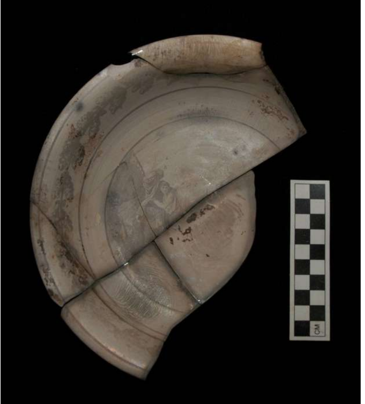
Figure 5. A French earthenware plate with a fine transfer print