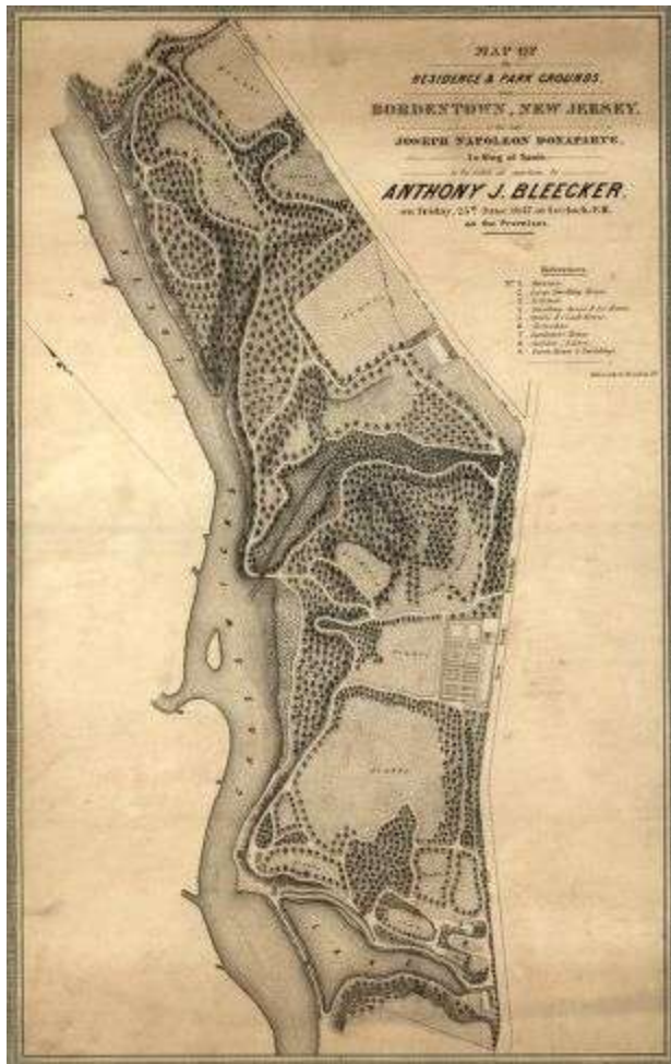
Figure 3. Lithograph “Map of the Residence and Park Grounds, Bordentown, New Jersey, Joseph Napoleon Bonaparte” (Miller 1844).